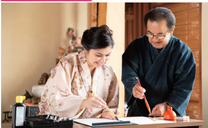
Calligraphy Use a brush to write Japanese characters