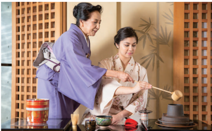
Tea Ceremony Make your own matcha