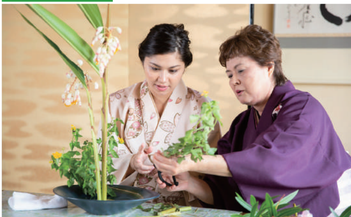
Flower Arrangement Arrange tropical flowers